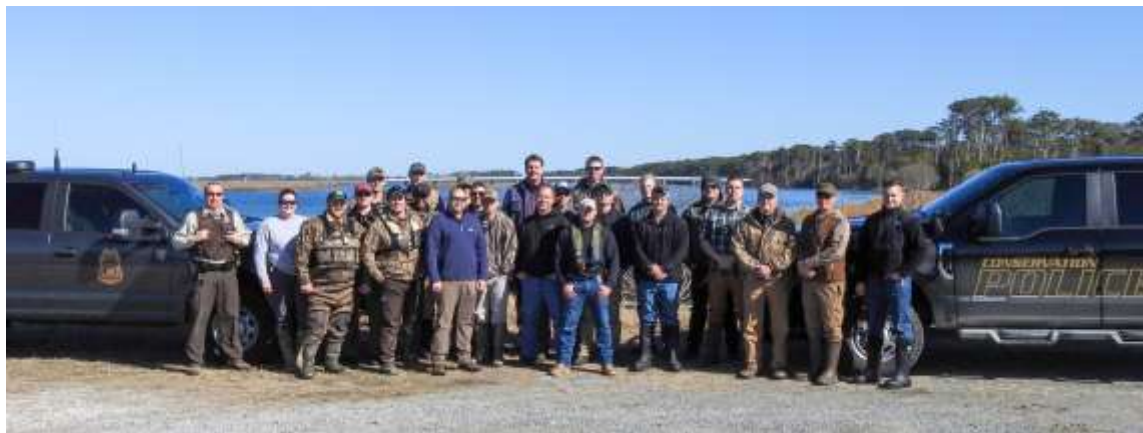
Waterfowl Game Warden Experience Class Picture on Chincoteague Island