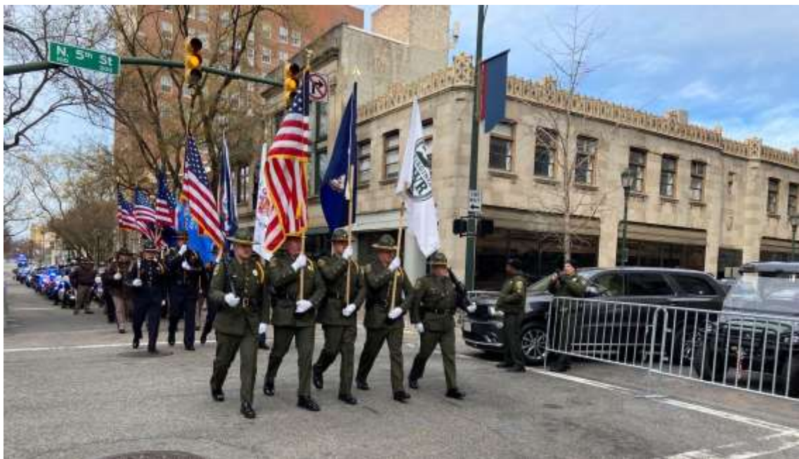
Inaugural Parade w/DWR Honor Guard in the front and K-9 at the end in a Patrol Boat