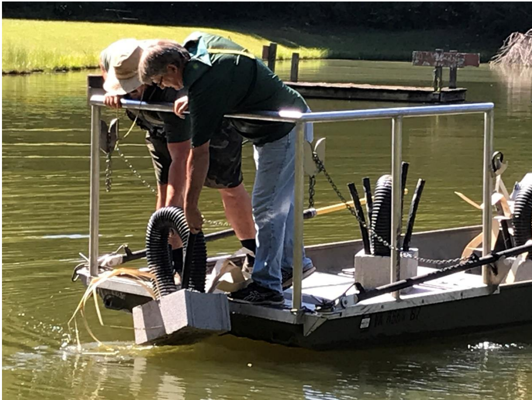
Installation of fish attractor structures placed along shoreline within 50-70 feet from bank, September 2022.